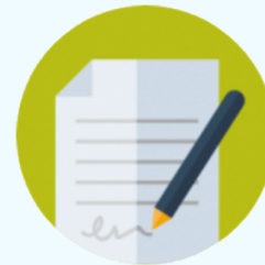
Unforeseen Illness, Injury or Death (including Coronavirus)

As the Coronavirus pandemic continues to disrupt life on a global scale, we've yet to understand what our "new normal" will be. What we do know, however, is that the virus could potentially impact people's holiday plans for some time to come.